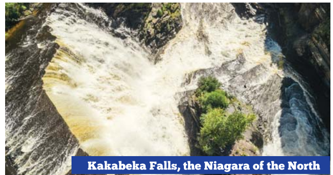
Kakabeka Falls, the Niagara of the North