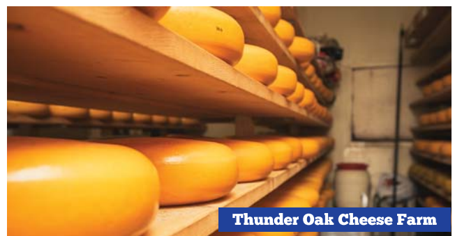
Thunder Oak Cheese Farm