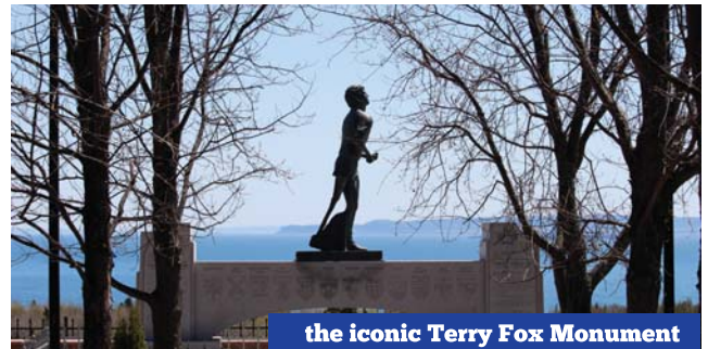
the iconic Terry Fox Monument

Enjoy 9 holes of golf on one of Thunder Bay's most scenic courses with a $20 voucher for the restaurant for only $49 per person plus tax. Book by phone at (807) 475-8925 using code CCCAGM18 .