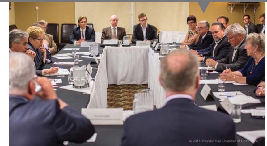
June 16, 2015: Ontario Premier Kathleen Wynne joined Chamber members and local MPPs for a discussion of issues related to manufacturing, natural resources, taxes, and labour force